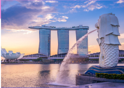
Innovative city typ