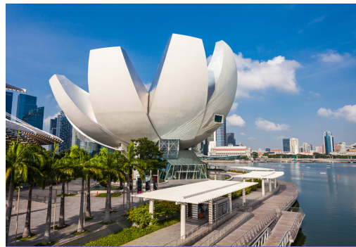
Museum of science