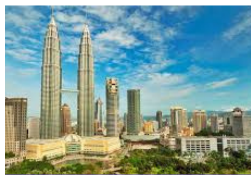
KL City tour