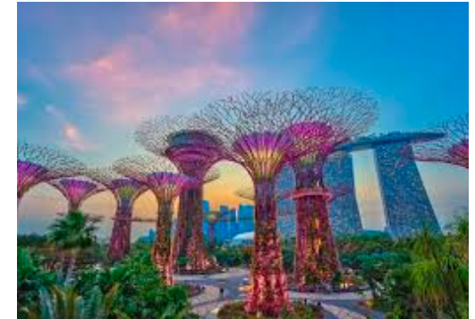
Gardens by the Bay