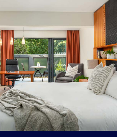
Neighbourgood, 60 Corporation Street, Cape Town

Transfer prices can include up to 2 people per vehicle - same flight & address