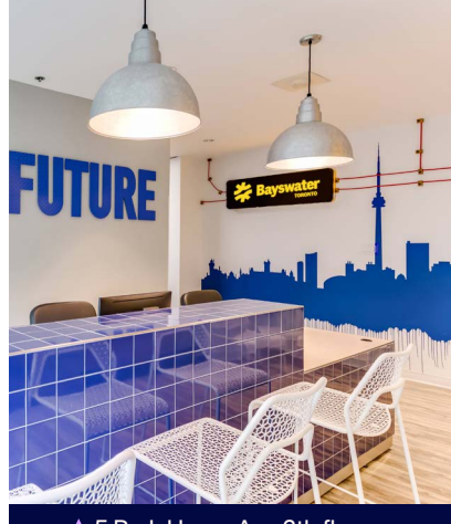
▲ 5 Park Home Ave 6th floor, North York, Toronto ON M2N 6L4