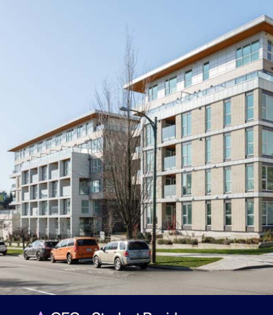
▲ GEC - Student Residences -Vancouver and Burnaby, BC

Transfer prices can include up to 2 people per vehicle - same flight & address