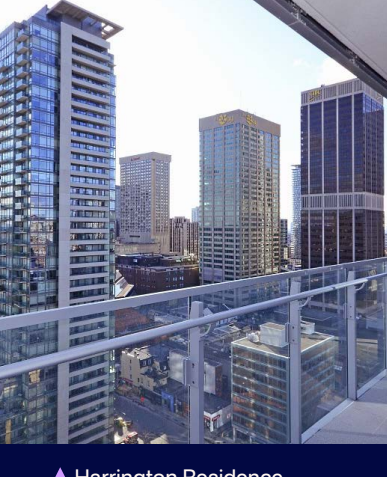
Harrington Residence 561 Sherbourne St Unit 2703