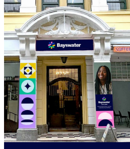
▲ Leadership House Building 40 Shortmarket Street

A combination of 20 Cambridge exam preparation lessons + 5/10 General English lessons