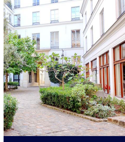
▲ 13 Passage Dauphine, 75006 Paris